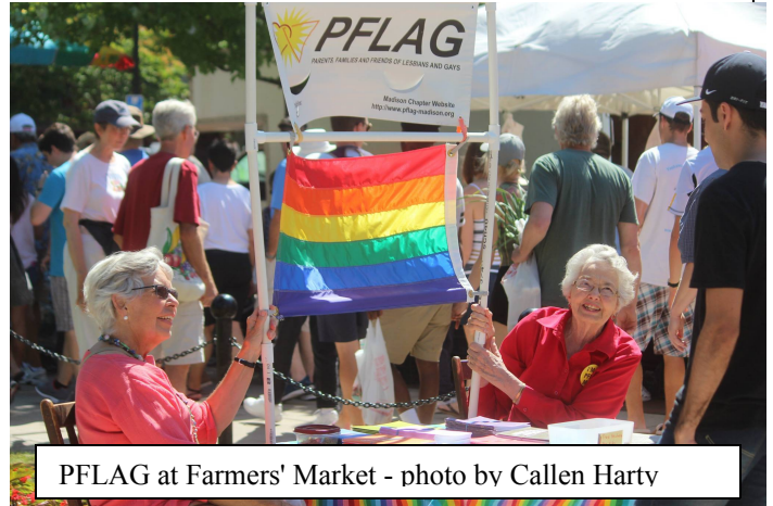
PFLAG at Farmers' Market